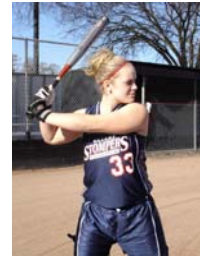
Bad – Barred Arm