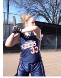
Bad – Front Elbow up