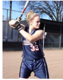
Bad – Back Elbow up