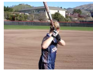
Bat Angle too Steep