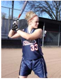
Good – Elbows Down