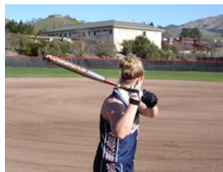
Bat Angle too Flat